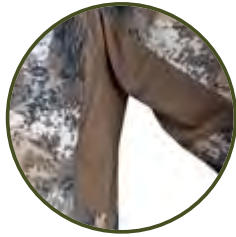
(ARM PIT VENT)