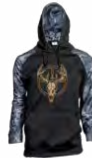
(BLK OUT-DEER LOGO)