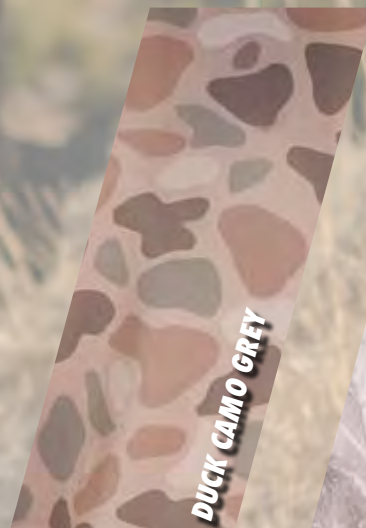
DUCK CAMO GREY