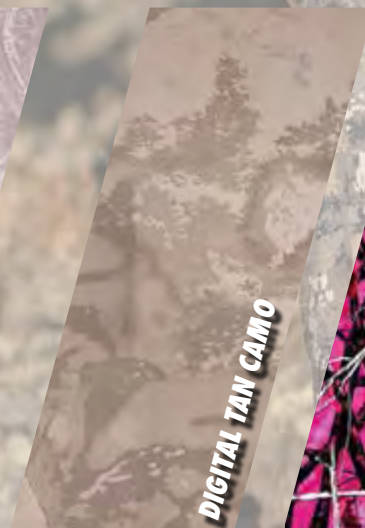
DIGITAL TAN CAMO